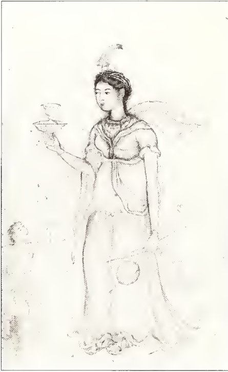
Figure 11. Female allegorical figure in the style of Basawan, attributed to Nar Singh. India, Mughal period, Akbar period, ca. 1585–90. Ink and opaque watercolor on paper, 8.8 x 5.6. Smithsonian Institution, Freer Gallery of Art, Gift of Ruth and Sherman Lee, F1995.13